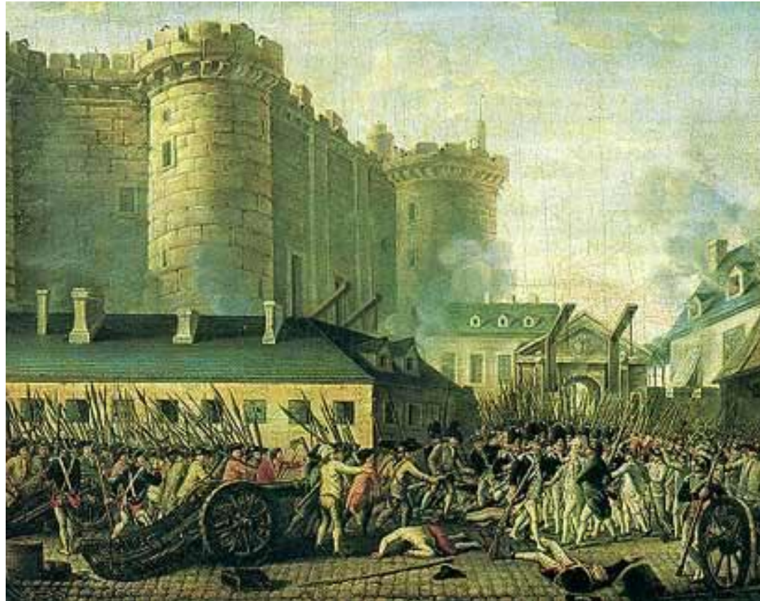
French Revolution - Storming the Bastille